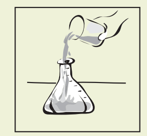
7. Measure temperature after 3 minutes.