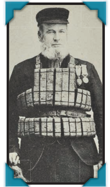
A man wearing a cork life jacket

In 1854, Captain John Ward invented a life jacket using small pieces of cork sewn together. The cork life jacket was good at keeping people afloat, but it was not very comfortable to wear. Also, cork is very hard, so people wearing cork life jackets sometimes broke bones when they fell or jumped into the sea.