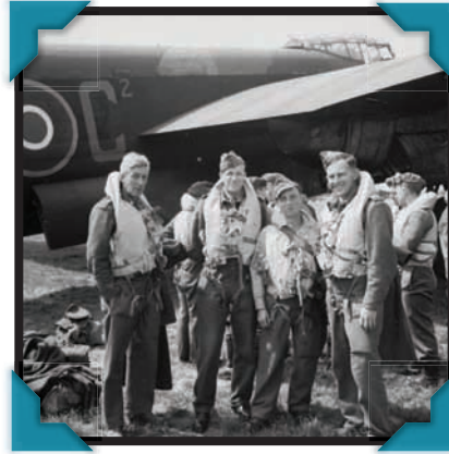
New Zealand soldiers wearing inflatable life jackets

During the 1920s, an American named Peter Markus invented a better life jacket that could be inflated (puffed up with gas). Inflatable life jackets saved many lives during the Second World War.