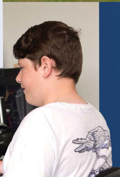
BEN'S BASE STATION

barometric pressure: the weight of the air as it presses down on everything below it (also called atmospheric pressure)