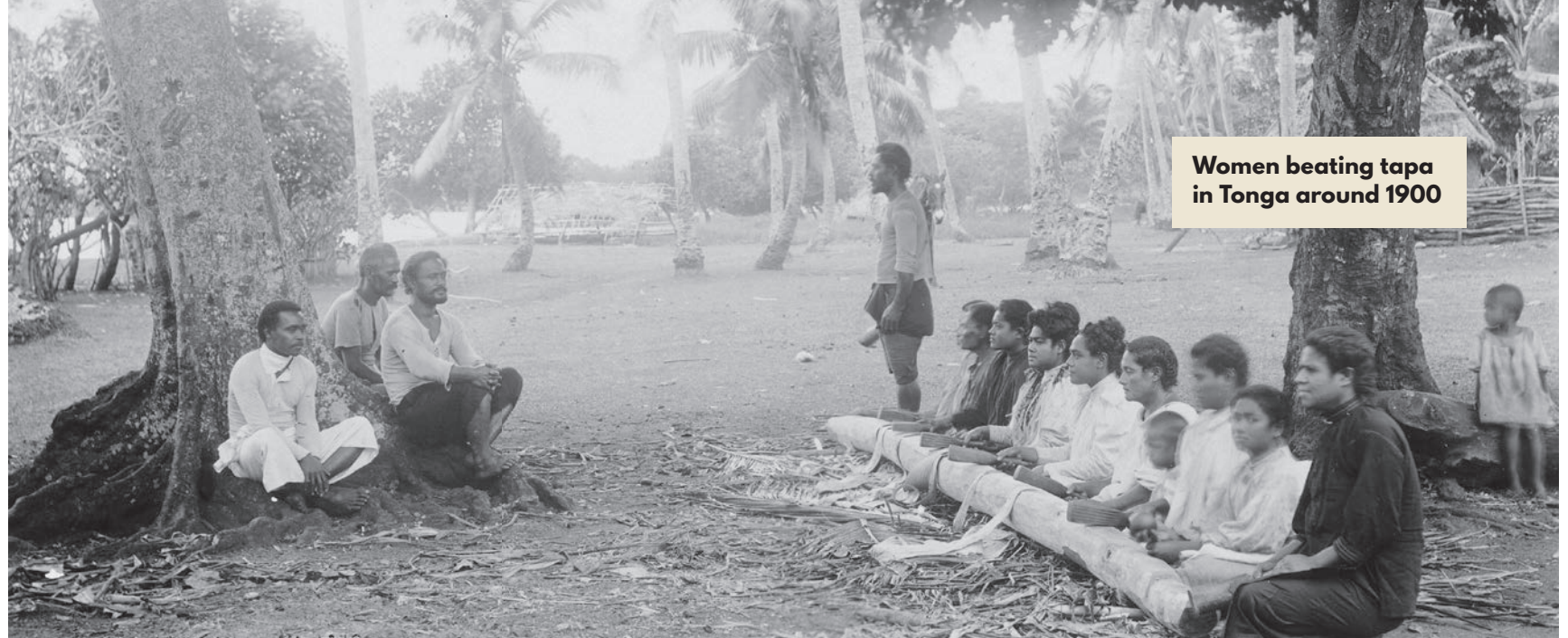
Women beating tapa in Tonga around 1900

An aute maker also needs something to beat their cloth on. For this, they use a specially shaped piece of wood called a kua (in ke 'ōlelo Hawai'i ). Kua are hollow, which results in a drumming sound when the cloth is beaten, and like patu aute, they need to be strong. Nikau's kua is made from milo, a hardwood that's native to the Hawaiian Islands.