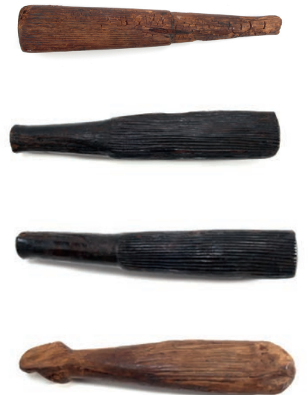
Patu aute from the Auckland War Memorial Museum Tāmaki Paenga Hira