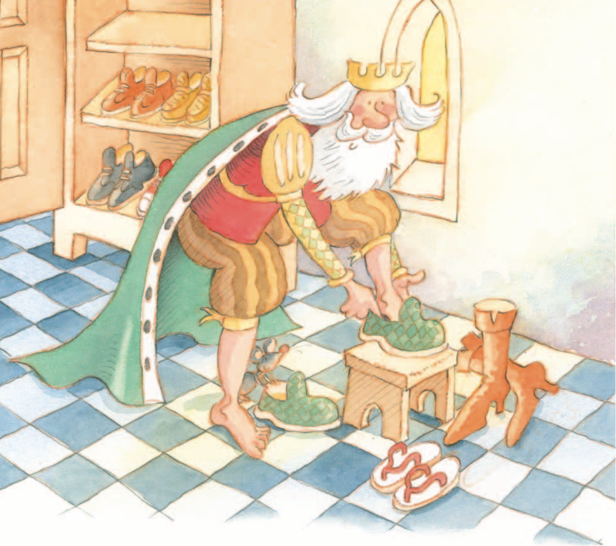
The King put on his Royal Slippers.